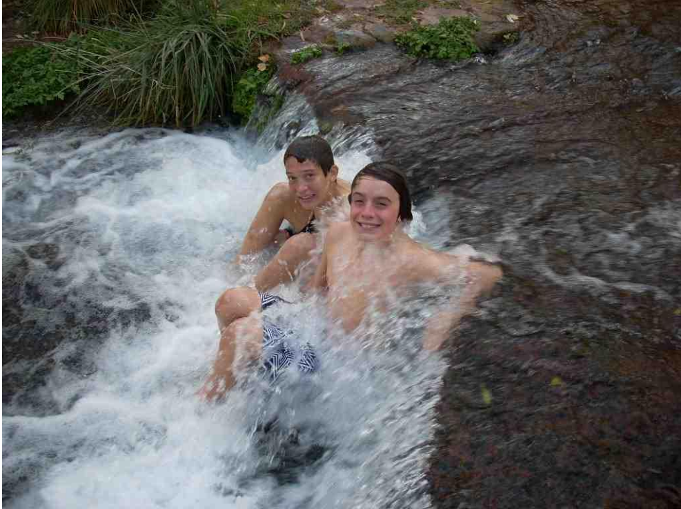
Come on in the Water is Fine